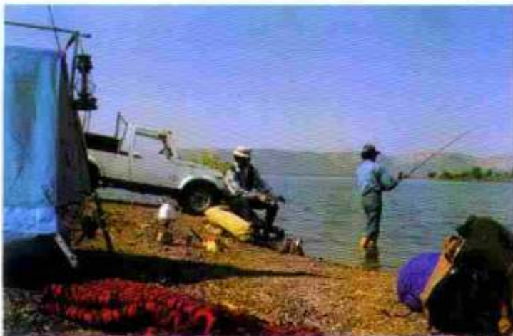
Soft top version

Motoring to new places can prove a delightful change. Pack